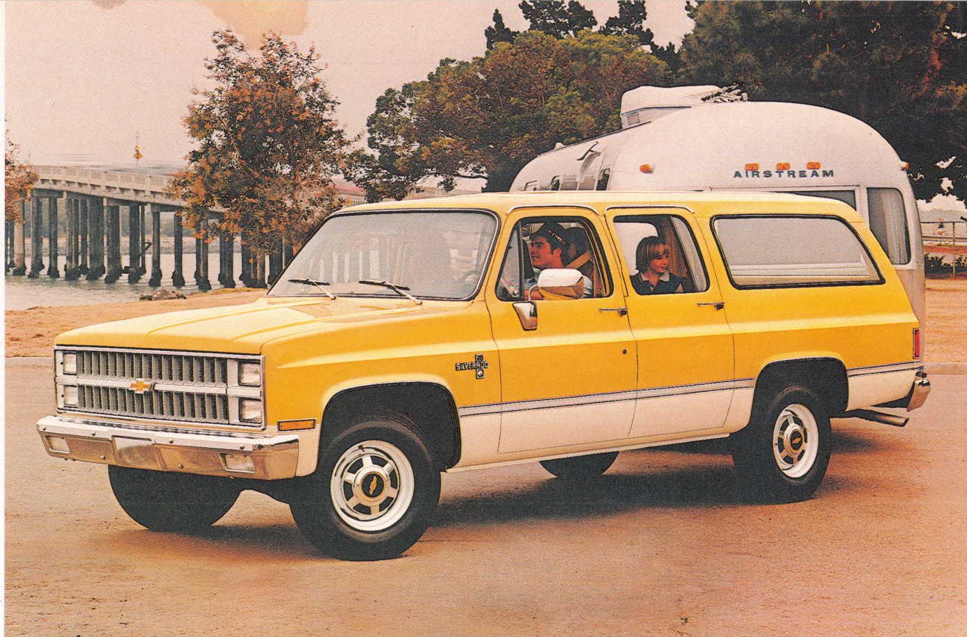
C20 Suburban Silverado shown in Colonial Yellow and Almond

A weight-distributing hitch platform for trailers up to 9500 lbs. is available, plus a wide range of trailering equipment including optional 25.8 or 33.3 gallon fuel tanks and trailer wiring harness.